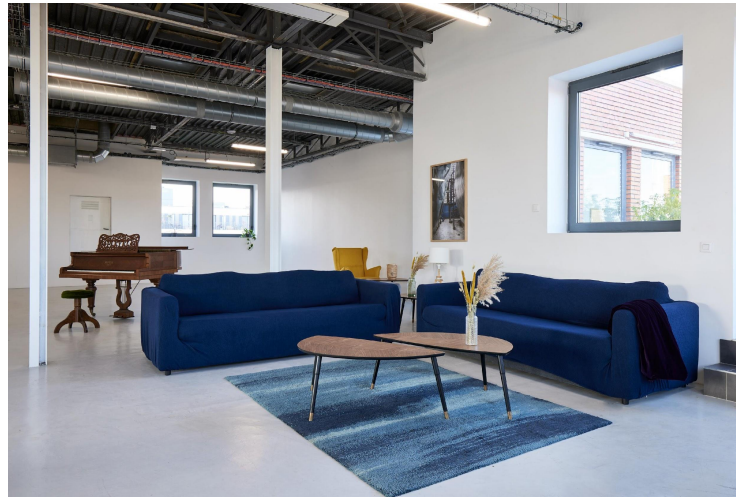
© Andreas B. Kruger / shared lounge

On the arrival and departure of the artist, a joint inventory of fixtures is carried out. Residents undertake to use the various premises at their disposal in a peaceful manner, maintaining them in good condition, and to report any problems observed. The Fondation Fiminco residency's accommodation is non-smoking and cannot accommodate pets.