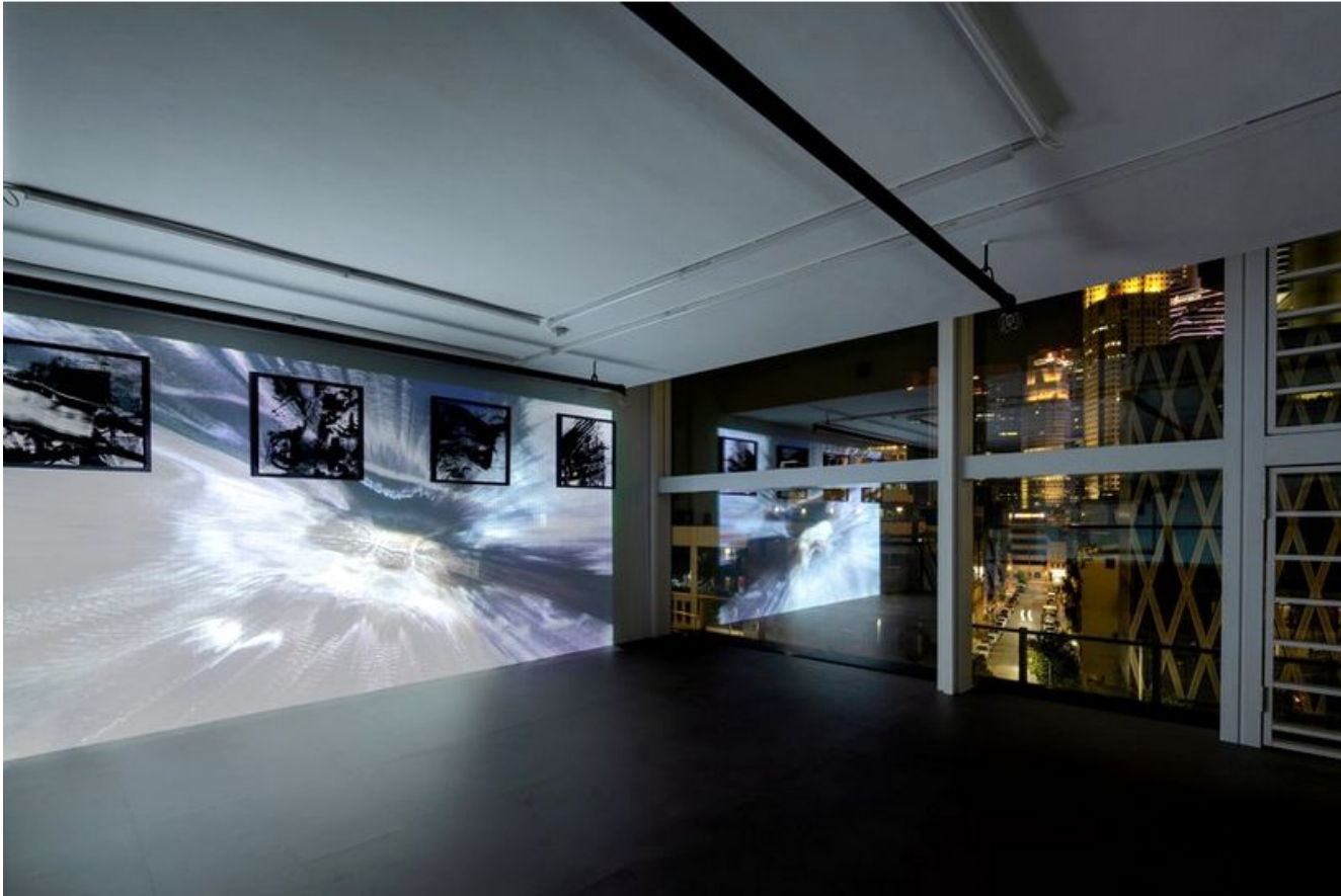
Instinc Soho Loft 2020 - 2021

Founded in 2004, INSTINC stands as a leading artist-run-institution based in Singapore.