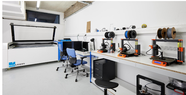
Photo and video workshop

Three 3D FDM plastic printers, 2 3D SLA resin printers, laser cutting.