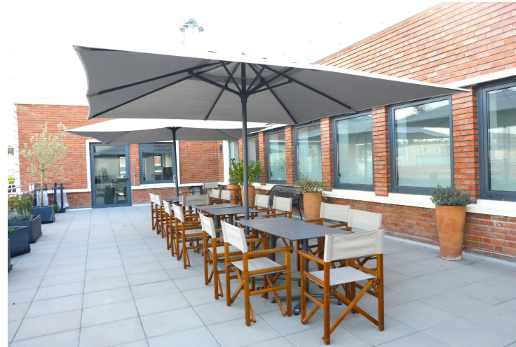
Terrace of the residence