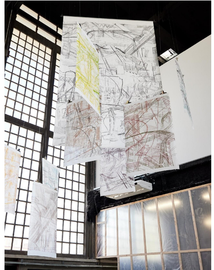
© Andreas B. Krueger, View of the exhibition Odyssees Urbaines, 2023 Artiste - Timo Herbst